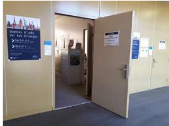
Internef building, 2 nd floor Above the cafeteria