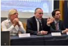
Representatives of McKinsey & Company, Solvay and SAS in a conference with QTEM students about Artificial Intelligence (Lausanne, Switzerland November 2017)

Corporate and Social Partners interact with our students through recruitment fairs, internship offers and presence at analytic conferences